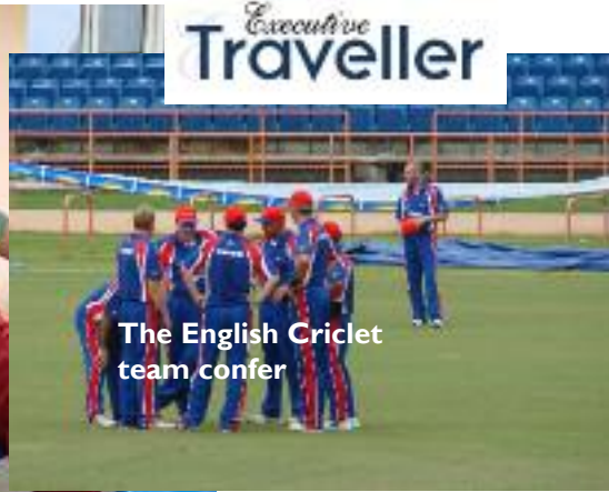
The English Cricket team confer