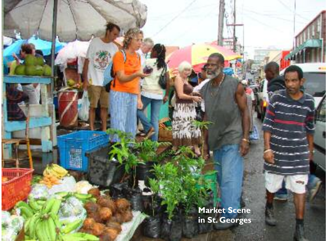
Market Scene in St. Georges