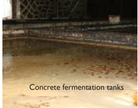
Concrete fermentation tanks

a water-adventure trip that will include snorkelling at the underwater Sculpture Park in Moliniere Bay organised by Grenada SeaFaris.