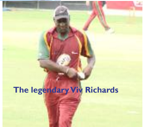
The legendary Viv Richards