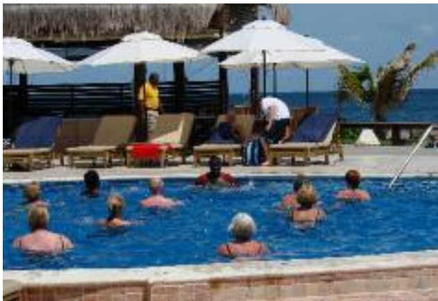
Aqua aerobics at La Source

La Source opened its doors on 1 February 2008 after a full renovation and refurbishment. The complex aims to regain its place amongst the top spa complexes in the world with its new wellbeing centre and spa facilities.