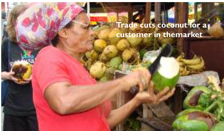
Trade cuts coconut for a customer in the market

tion house elegantly located on the Morne Fedue mound has more than lunchtime treat in store for visitors. The plantation itself displays the grandeur of misty mountains, lush vegetation, and romantic hills and valleys. Its beauty is adorned with a rich array of colours of poinsettias, flamboyant trees, bougainvilleas and palms.