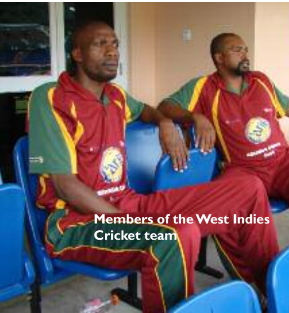
Members of the West Indies Cricket team